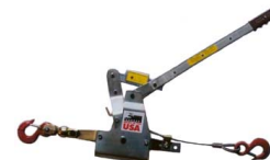
Maasdam Pow'R Pull 6000S 3 Ton Cable Puller $205.61 - $139.58 Save: 32% off